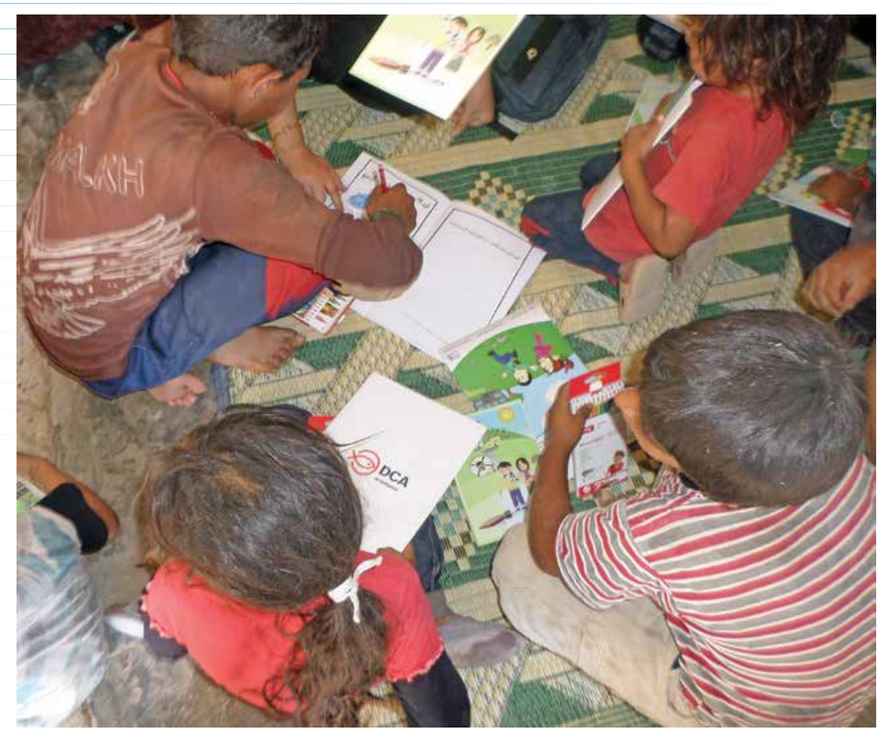
Risk education to children in northern Syria, 2015.

urgency for displaced populations in Syria wishing to return to their homes as soon as they perceive it safe to do so.