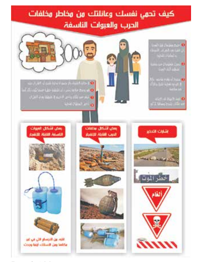
Figure 2. Adult returnee poster.

target adult returnees. The explosive threat posed to civilians in Syria involves landmines, unexploded ordnance (UXO), booby traps, and IEDs, or a combination of these explosive items; as a result, risk education materials targeting adult returnees have been designed to include all explosive threats. As seen in Figure 2, the different categories of explosive items are distinguished on the poster. Considering the limited time and opportunities that were available to target those returning home, this was considered the most efficient and effective approach to raising awarness about the threats posed by explosive hazards.