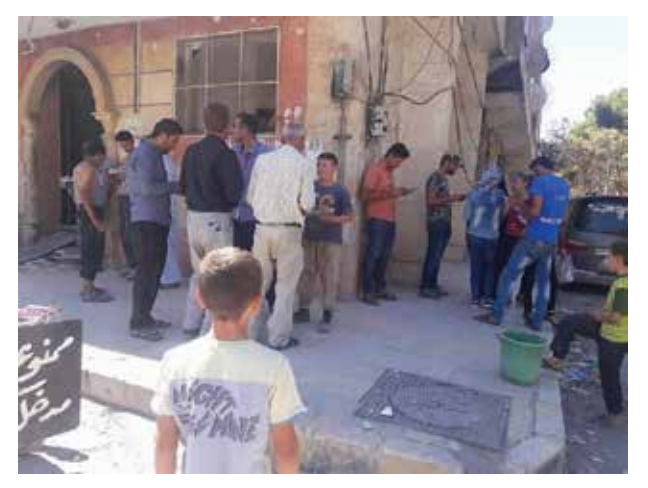
IED risk education to recent returnees in northern Syria, 2016.

Analysis of explosive contamination resulting from the conflict in Syria has shown that the types of explosive weapons used are varied and include landmines, various ordnance (e.g., artillery), cluster munitions, booby traps, and IEDs.<sup>2,3</sup>