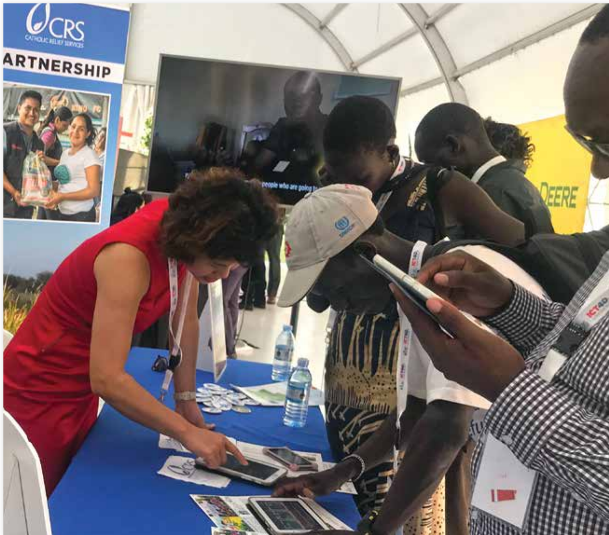
Visitors try the MRE app at the CRS booth at the Information and Communication Technology for Development (ICT4D) conference in Uganda.

technology for knowledge sharing. The Vietnam team hosted an internal webinar on 13 December 2018 to educate other CRS stakeholders on the process, cost, intended uses of the app, and the data generated from its use. Furthermore, the app was widely shared through a forty-minute session and at the CRS booth at the Information and Communication Technology for Development (ICT4D) conference 7 in Uganda on 1 May 2019.