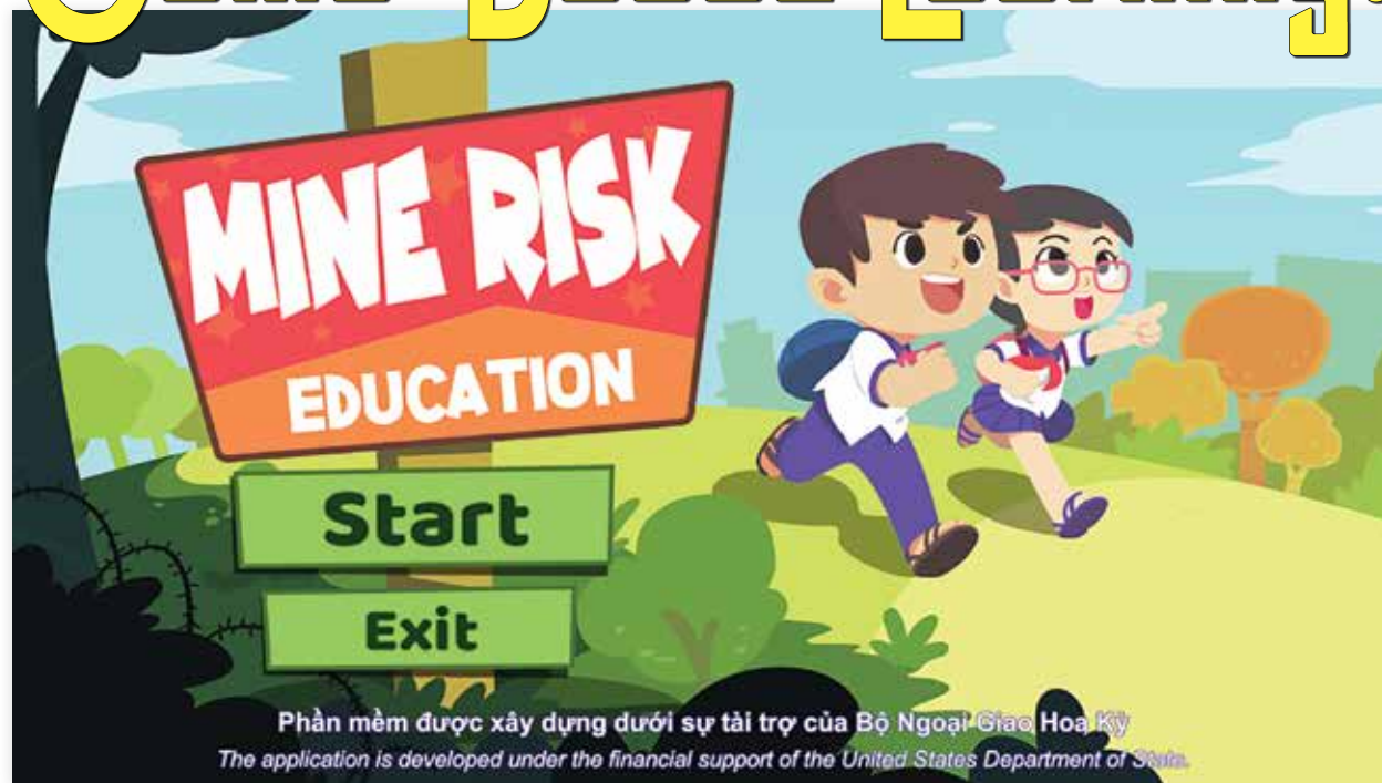
Figure 1. Screenshot of start page of MRE app.